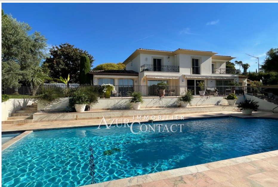
Villa 2352 Mougins

in residential area closed between village and golf contemporary villa south very bright on flat landscaped garden with large terraces and swimming pool. spacious reception with lounge and dining room, kitchen équipée. 1 ground floor bedroom with shower room. Upstairs has 3 bedrooms and 2 baths. large basement 60m 2 playroom. laundry. shelter 2 voitures. prestations treated. view garden and the old village of Mougins on the floor. renting furnished € 6000 gardener and pool maintenance included.